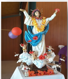
Presentation of the lord