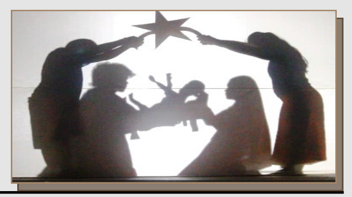
The Waves Newsletter Catholic Diocese of Gizo.

During the farewell celebration from afternoon until night, about 400 children from PPY, primary and secondary schools performed a show of great talent and creativity to expressing their performances in a more meaningful and significant way for all.